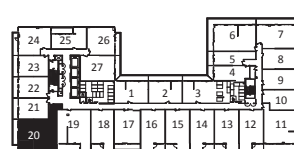
Level 10 & 11