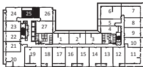
Level 10 & 11